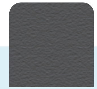
LAYKOLD DARK GREY