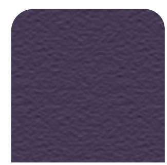
LAYKOLD ROYAL PURPLE