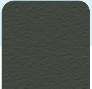
LAYKOLD FOREST GREEN