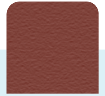
LAYKOLD BRICK RED