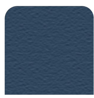
LAYKOLD DARK BLUE