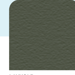
LAYKOLD DARK GREEN