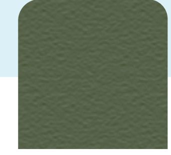
LAYKOLD MEDIUM GREEN